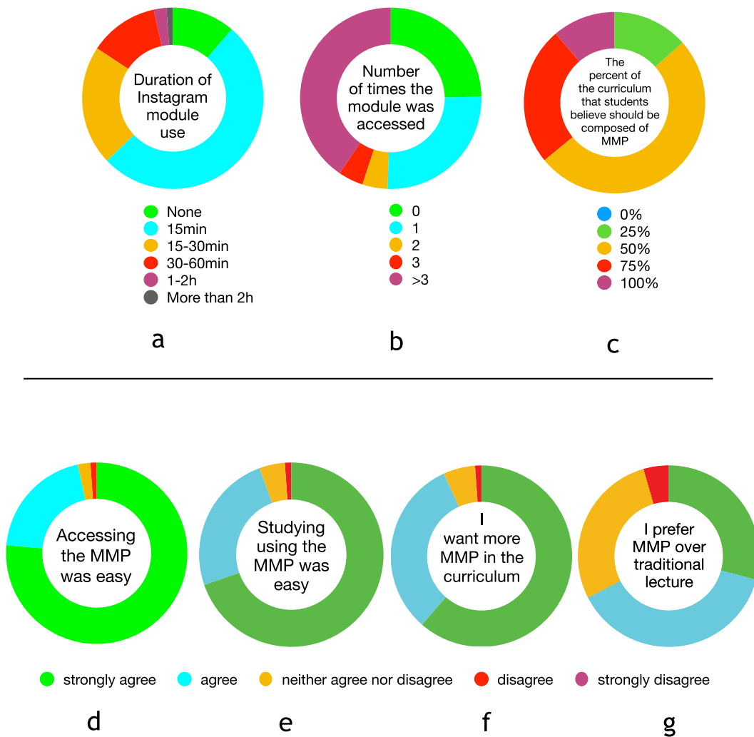
Figure 3: Student feedback on MMP use: most students spent 15 min on the modules (a) and accessed them more than three times (b). All students wanted at least 25% of their curriculum to be MMP-based, (c) most students found the modules easy to access (d) and study, (e) and most wanted more MMP lessons in the curriculum (f) and preferred them to traditional lectures (g).