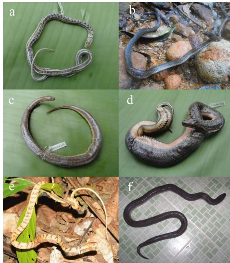
Fig. 2. a) Amphiesma stolatum (CLBH 13307), b) Hebius leucomystax (CLBH 14336), c) Enhydris enhydris (CLBH 14312), d) Enhydris subtaeniata (CLBH 13321), e) Pareas hamptoni (CLBH 14307), f) Xenopeltis unicolor (CLBH 12303) from Binh Dinh Province, Vietnam.