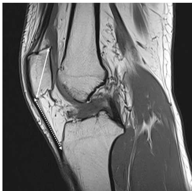
Figure 1 Measurement of patellar height and the length of the patellar ligament. The patellar length (white double arrow) was measured from the superior articular margin to the distal anterior tip of the patella. The patellar ligament length (white dashed double arrow) was measured along the posterior margin of the ligament from the patellar attachment to the tibial insertion.